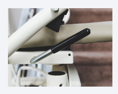
Swivel seat for a safe exit