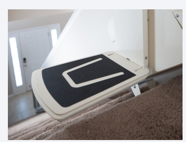
Wide footrests for stability and extra comfort.*

*Wider foot rest vary slightly in style on each Pinnacle model. See model detail for more information.