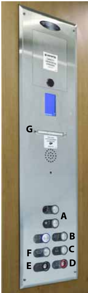
Figure 1 Keypad COP