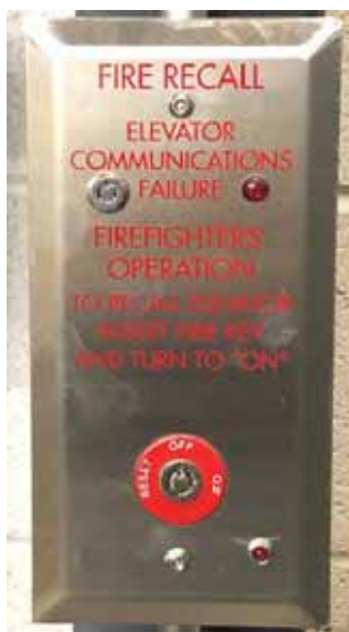
Figure 3 Phone Monitor

NOTE: There is an alarm silence key provided to turn off the beeper.