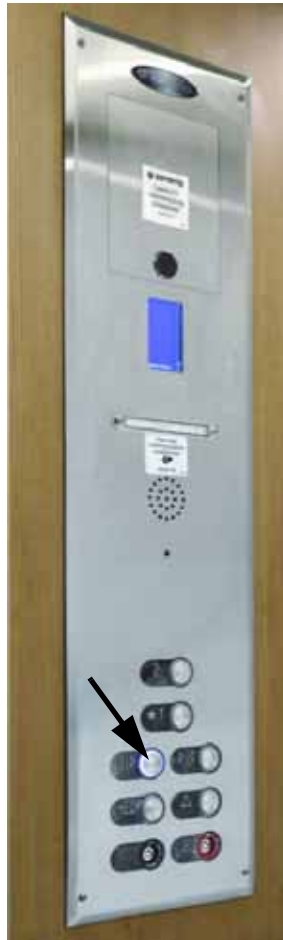
Figure 3 Door Open Button

When the elevator is at a landing level, the doors can be opened by pressing the Door Open button. Normally the doors will have opened and already closed automatically. The Door Open button allows the door to be reopened.