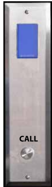
Figure 2 Hall Call Station

In the event of a building power failure, the door system is provided with a temporary power back-up system to continue the opening operation for a number of times. On resuming normal building power, the back-up system will turn OFF and begin automatically recharging.